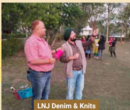
LNJ Denim & Knits