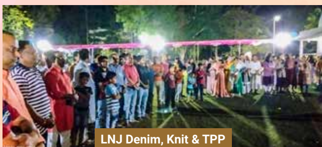
LNJ Denim, Knit & TPP