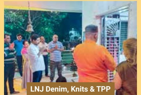
LNJ Denim, Knits & TPP