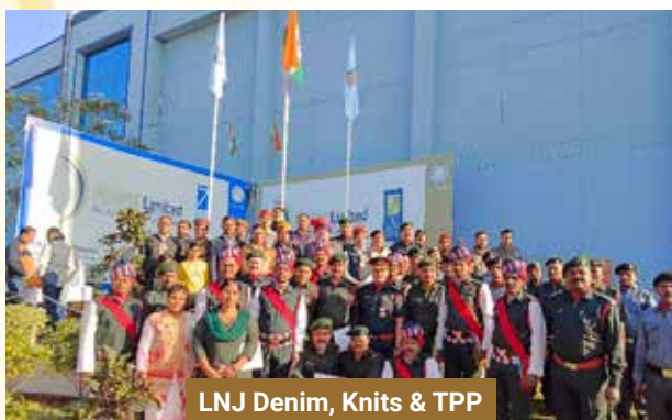
LNJ Denim, Knits & TPP

Unit. Prizes were also distributed to selected outstanding performers in the categories of security, production, attendance, etc.