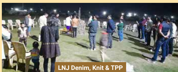
LNJ Denim, Knit & TPP

All the staff and their family members thoroughly enjoyed the event.