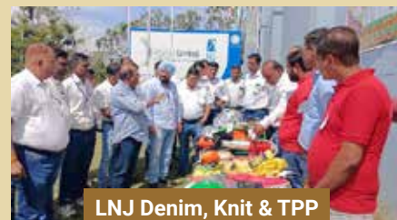
LNJ Denim, Knit & TPP