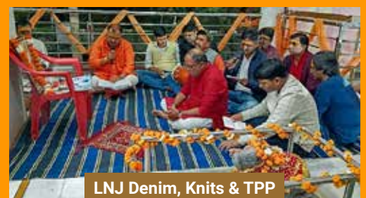
LNJ Denim, Knits & TPP